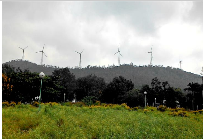
Wind Power Plant