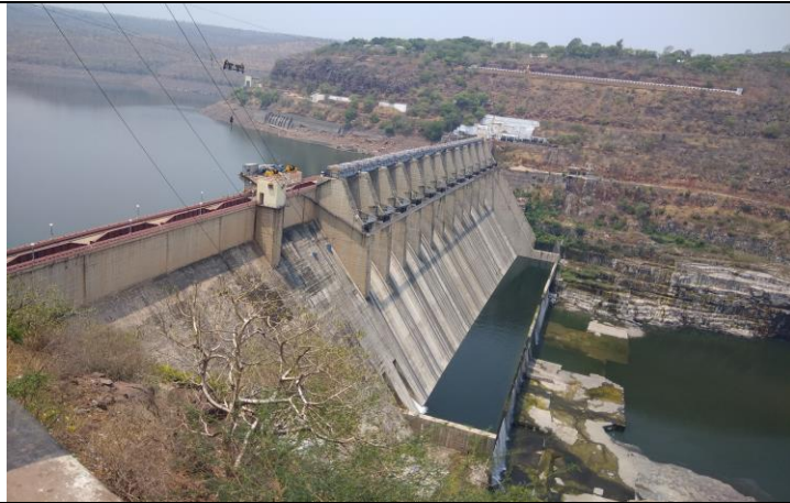
Srisailem Right Bank Power House

Karakambadi Road, Opposite LIC Training Centre, Tirupati – 517 507. Accredited by NBA (B.Tech – CSE, ECE,EEE,Mech.,Civil and IT) & NAAC with 'A' Grade Approved by AICTE, New Delhi permanently affiliated to JNTUA, Ananthapuram.