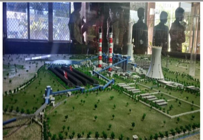
Damodaram Sanjeevaya TPP