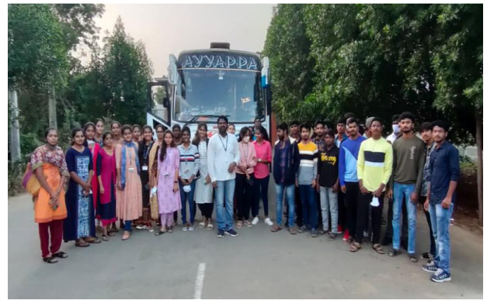
Somasila Power Plant Visit